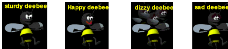
A few of DeeBee's moods

Since our intent is for DeeBee to be used over an extended period of time, our main design priority was satisfaction. Given that the main goal of DeeBee is to teach children about the relationship between blood sugar levels, behaviors, and treatment (food and insulin), it is crucial that children use DeeBee consistently over a significant period of time. The second goal of DeeBee is to provide comfort and companionship for a diabetic child. To achieve our goals, DeeBee needs to be fun! First, we ensured that the animated bee displays a cute and lovable personality. DeeBee flutters around the screen, in and out of his beehive, and is always ready to play. Second, our design strives to closely match DeeBee's behaviors and feelings to those that a diabetic child experiences. For instance, similar to a child, when a DeeBee's blood sugar is too high, DeeBee will have no energy to buzz around the screen and be very thirsty. If DeeBee's blood sugar is too low, DeeBee will be shaky, dizzy, grouchy, and sweaty. Our design is such that the bee is capable of a wide range of behaviors and expressions. The variety of actions will maintain the user's interest and engagement.