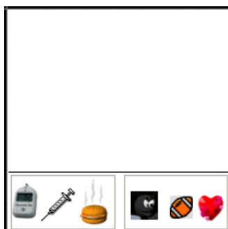
Version 2.0 Icons

Our user testing and continued research revealed that exercise was an important part of a diabetic child's life. So, we added a new feature, 'sport' (represented by the football icon), to make the learning more comprehensive and increase the satisfaction of playing with DeeBee. This new feature will teach diabetic children the effects of exercise on blood sugar levels.